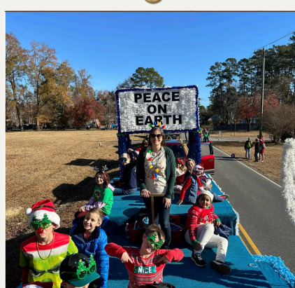
CONWAY CHRISTMAS PARADE