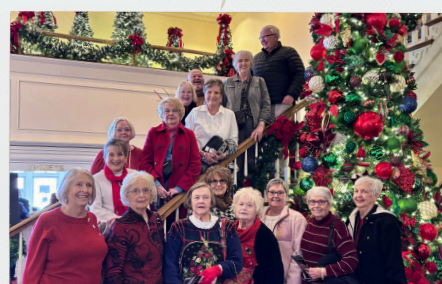
JOYFUL ENDEAVORS BRUNCH AND CHRISTMAS SHOW