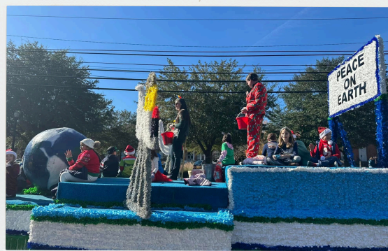
CONWAY CHRISTMAS PARADE