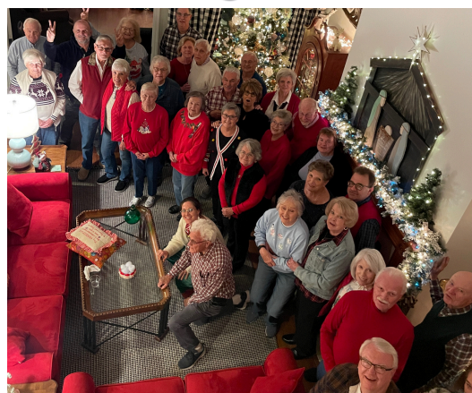
JOYFUL ENDEAVORS CHRISTMAS PARTY