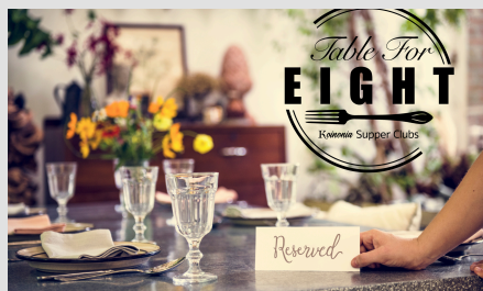
Table For Eight Supper Clubs

As part of our Koinonia focus this year, we are looking for ways to foster true fellowship throughout our congregation. A great way to build new relationships is around a meal.